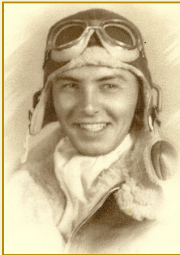
Dick Fleischer: Thunderbolt Over New Guinea